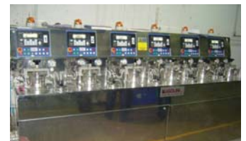
STATE-OF-THE-ART DYEING AND TESTING LAB

we have better control over color consistency compared to clients receiving shipments from multiple locations to complete an order." Lastly, Eric notes that Blue Generation's warehouse "stocks millions of garments, making our fulfillment capability unbeatable."