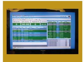
STATE-OF-THE-ART CALL CENTER MONITORS

The rapport that BG’s executives have developed with front-line employees surely benefits the customer as well. “We focus on making this an enjoyable work environment for our employees. If they feel they are treated well, then