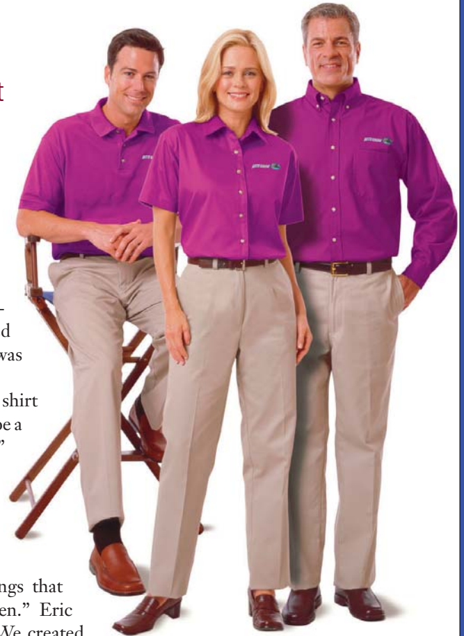
OUTFIT YOUR TEAM IN COORDINATED STYLES AND COLORS

year we are using that expertise and introducing polar fleece vests, pullovers, and jackets” says Phil.