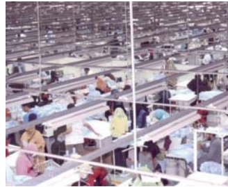
SEWING FACILITY WITH OVER 2,500 WORKERS

Phil adds. "Besides all this equipment, of course, there